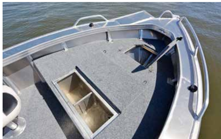
Top: There's a carpeted, elevated front casting deck.