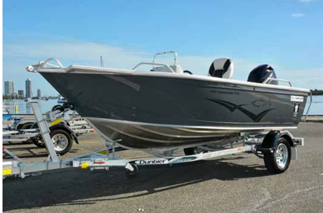
Above: The boat sits well on a Dunbier Centreline galvanised steel braked trailer.